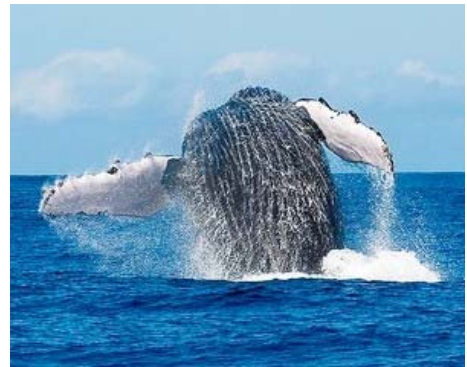
Tour boats may be the best way to see the giant ocean-going mammals put on aerial displays in Hawaiian waters.